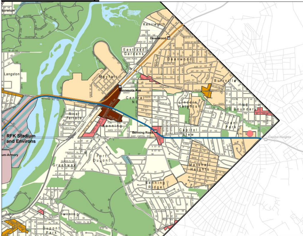
Generalized Policy Map